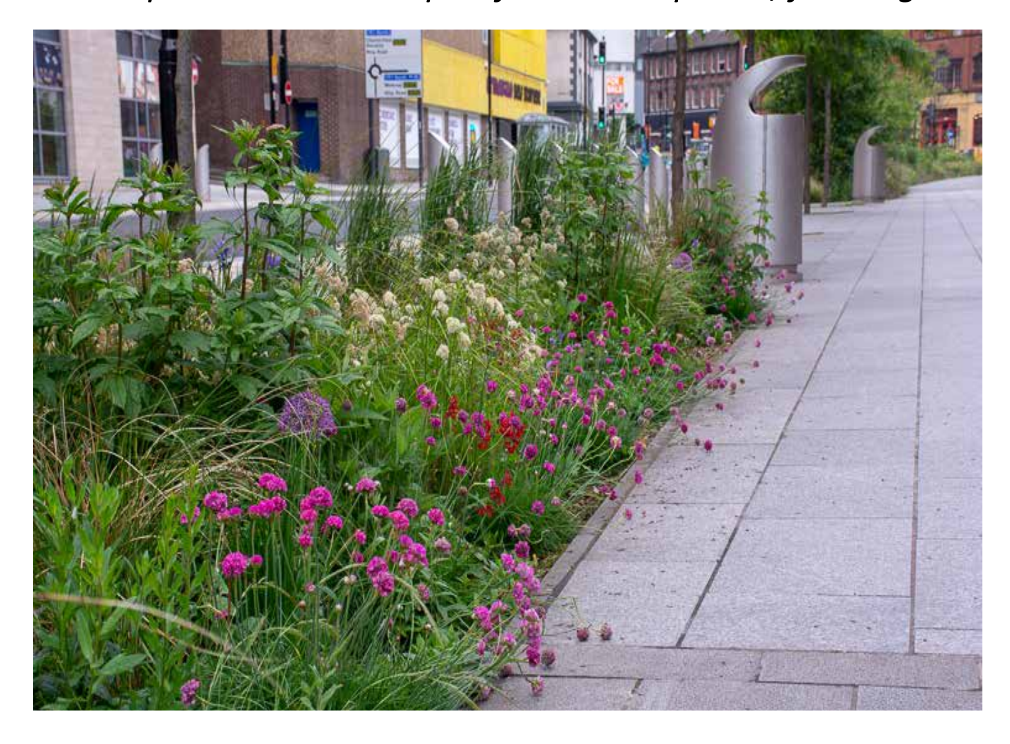
A line of new planting beds along Stockwood Road will cover raised tree roots, provide habitat for pollinators, interest and colour