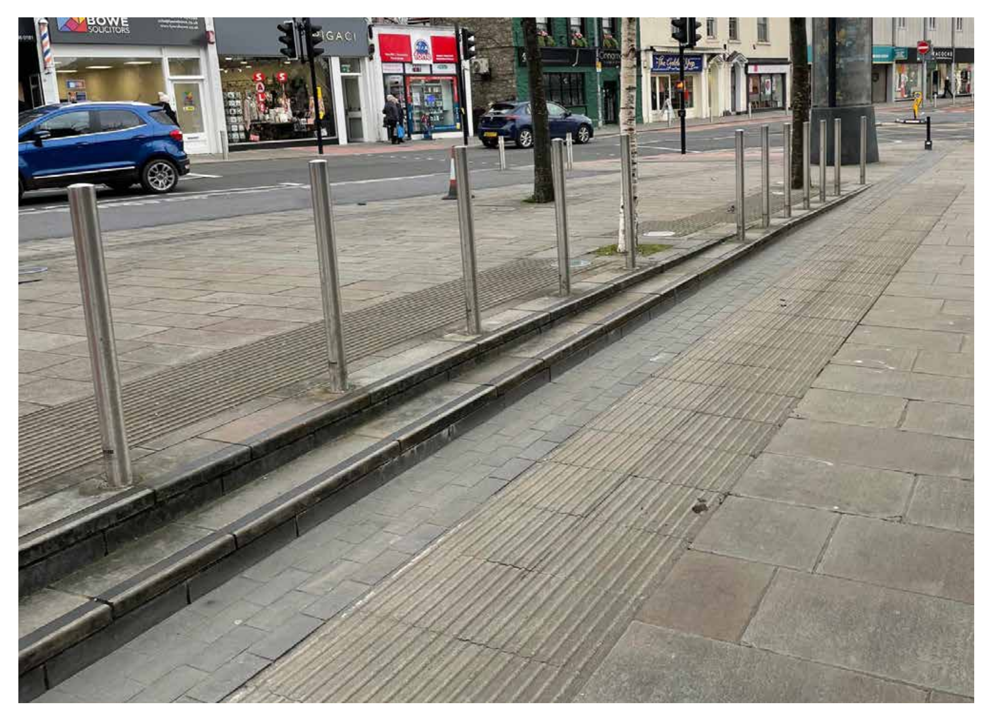
Steps that taper and gentle slopes will be created to deal with the change in level between the shops to the east and the square itself. The steps will have tactile paving on both sides.