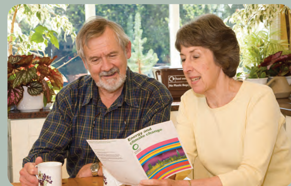
By considering eco-improvements to your home you could save money and do your bit for the environment too.