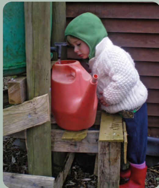
A water butt is a great way to save water – and you're never too young to start.