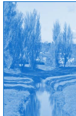
River Trym at Sea Mills