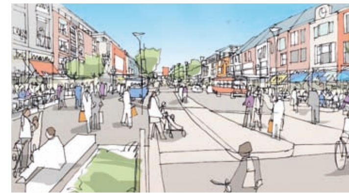
What could happen – a possible design for a new shopping centre

You can also ring the Knowle West helpline on 0117 922 3963 or visit www.bristol.gov.uk/kwrf