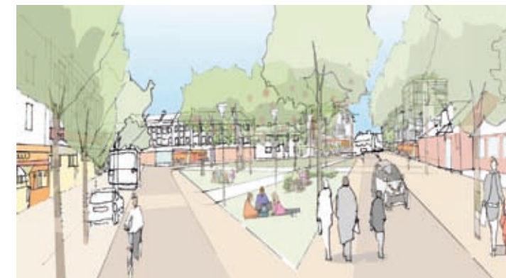
What could happen – a possible design for Filwood Broadway