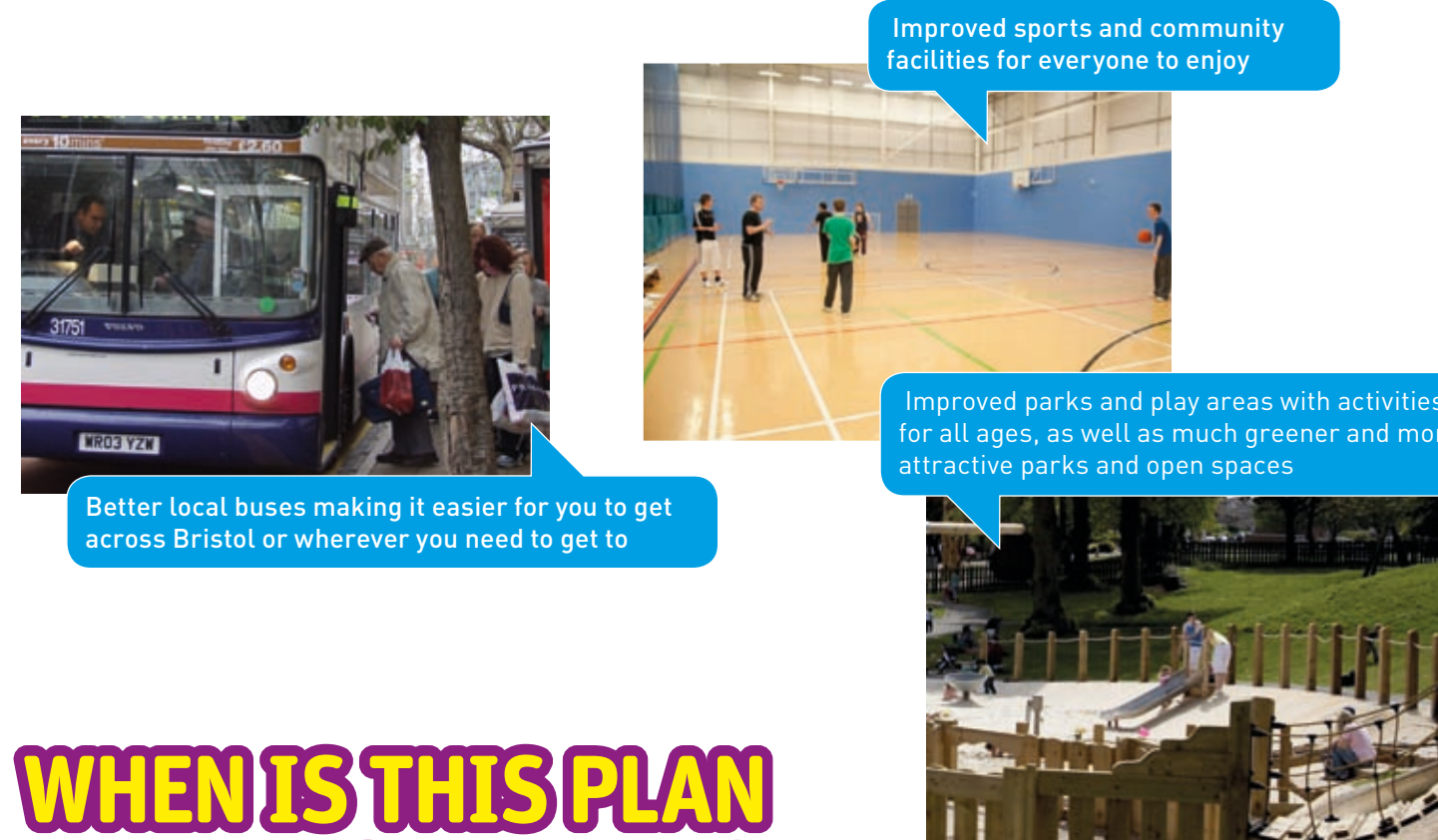
Better local buses making it easier for you to get across Bristol or wherever you need to get to

“A community full of confidence and pride, skilled and healthy, living in a thriving Bristol neighbourhood that is green and well-connected, and low in living costs.”