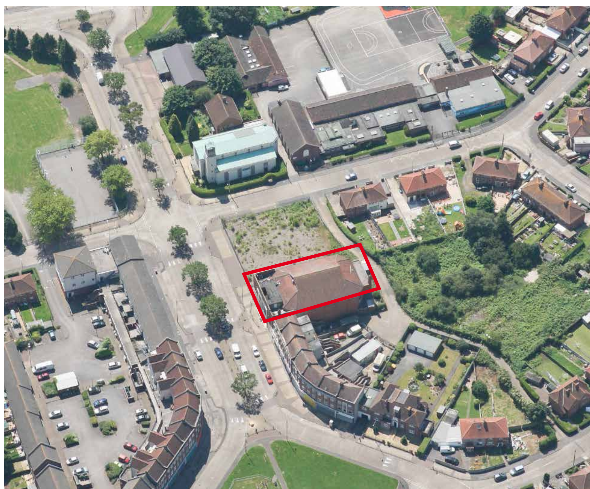
Aerial view of Filwood Broadway looking south