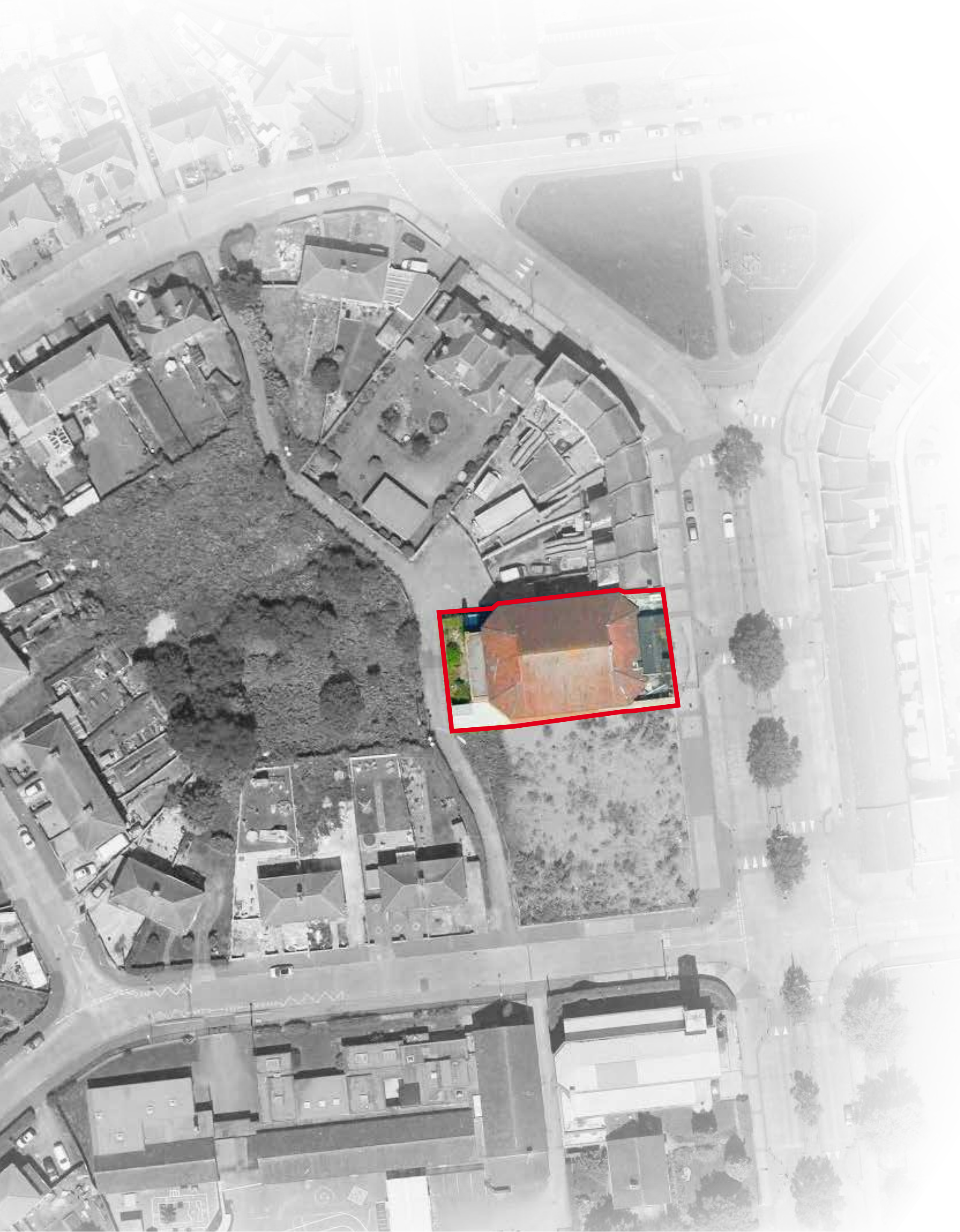
Aerial view of former cinema and adjacent sites

Modern aerial imagery © Blom Pictometry OS data © Crown copyright & database rights 2015 Ordnance Survey 100023406