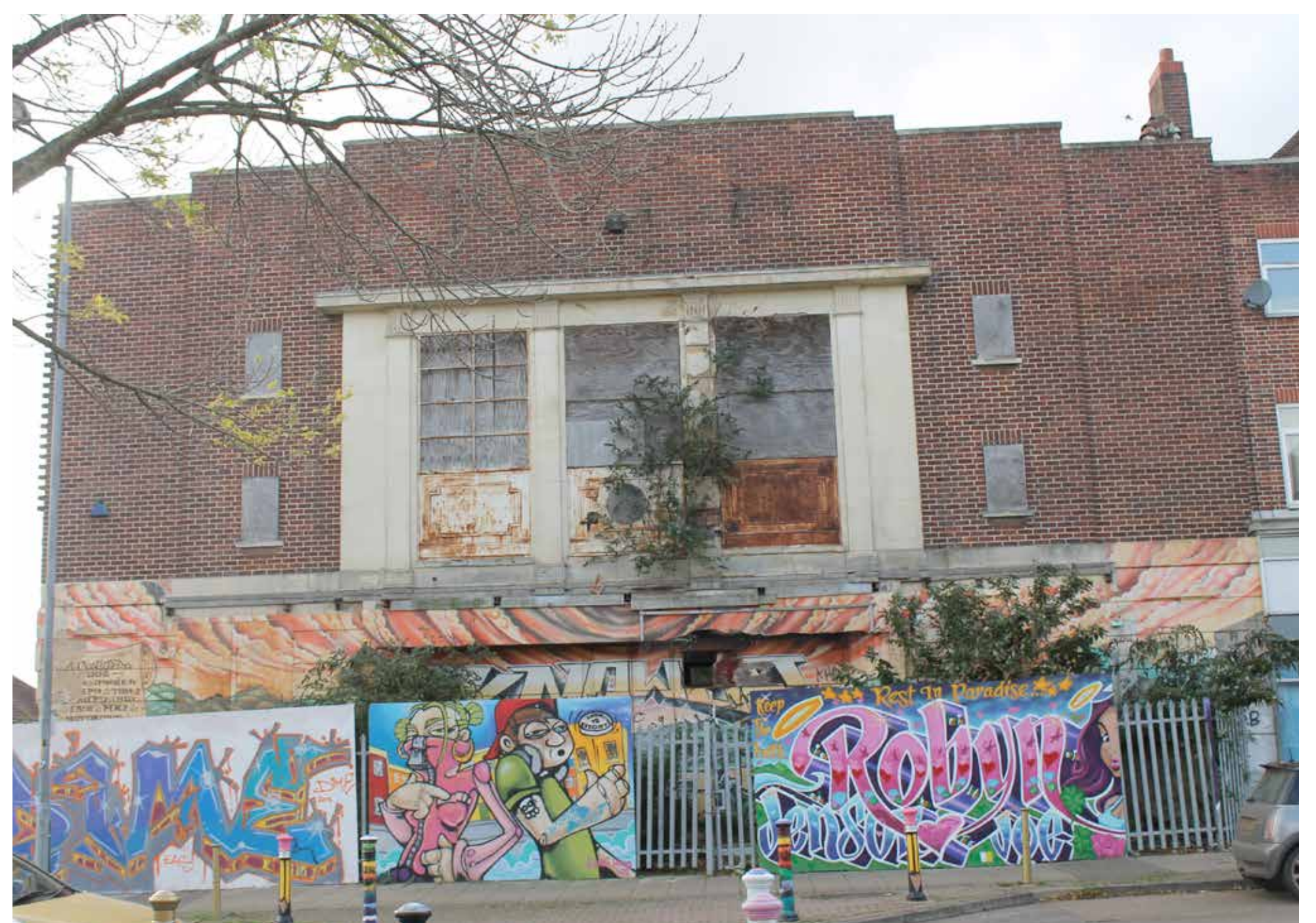
Front of former cinema