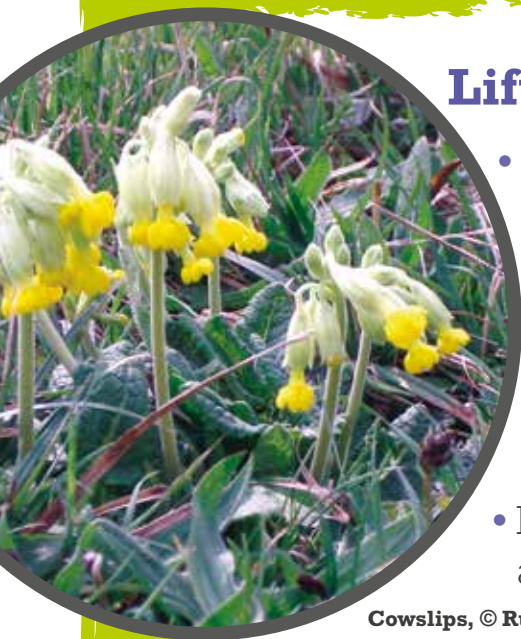
Cowslips

Bristol is fortunate to have these special reserves – they have so much to offer. This leaflet has been prepared to show you where they are, give you a taste of what's there and suggest when it's a good time to wander with wildlife. Look out for walks, events and activities for all interests throughout the year.