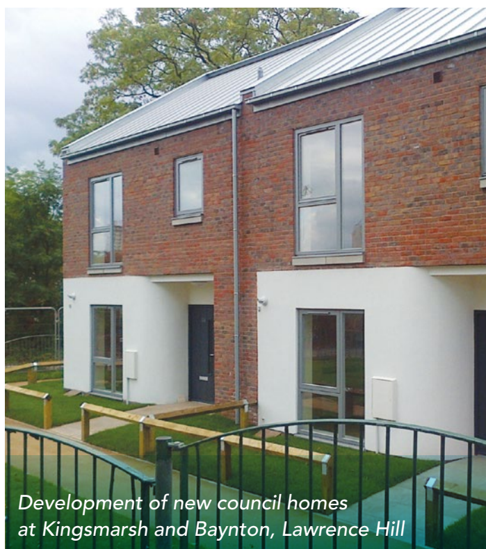
Development of new council homes at Kingsmarsh and Baynton, Lawrence Hill