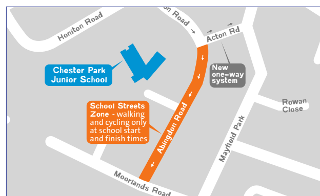
Chester Park Junior School, Hillfields