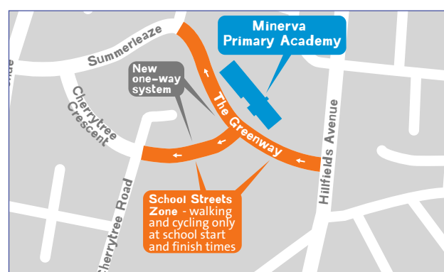
Minerva Primary Academy, Hillfields