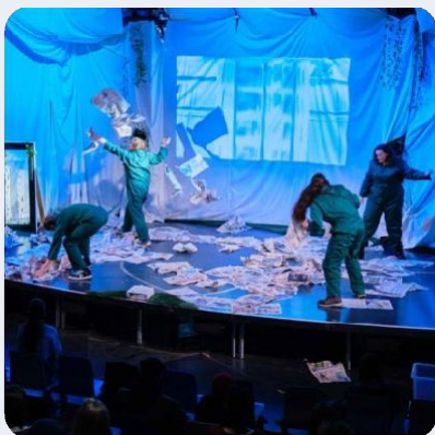
Many Minds, I've Been Waiting, © Jack Offord