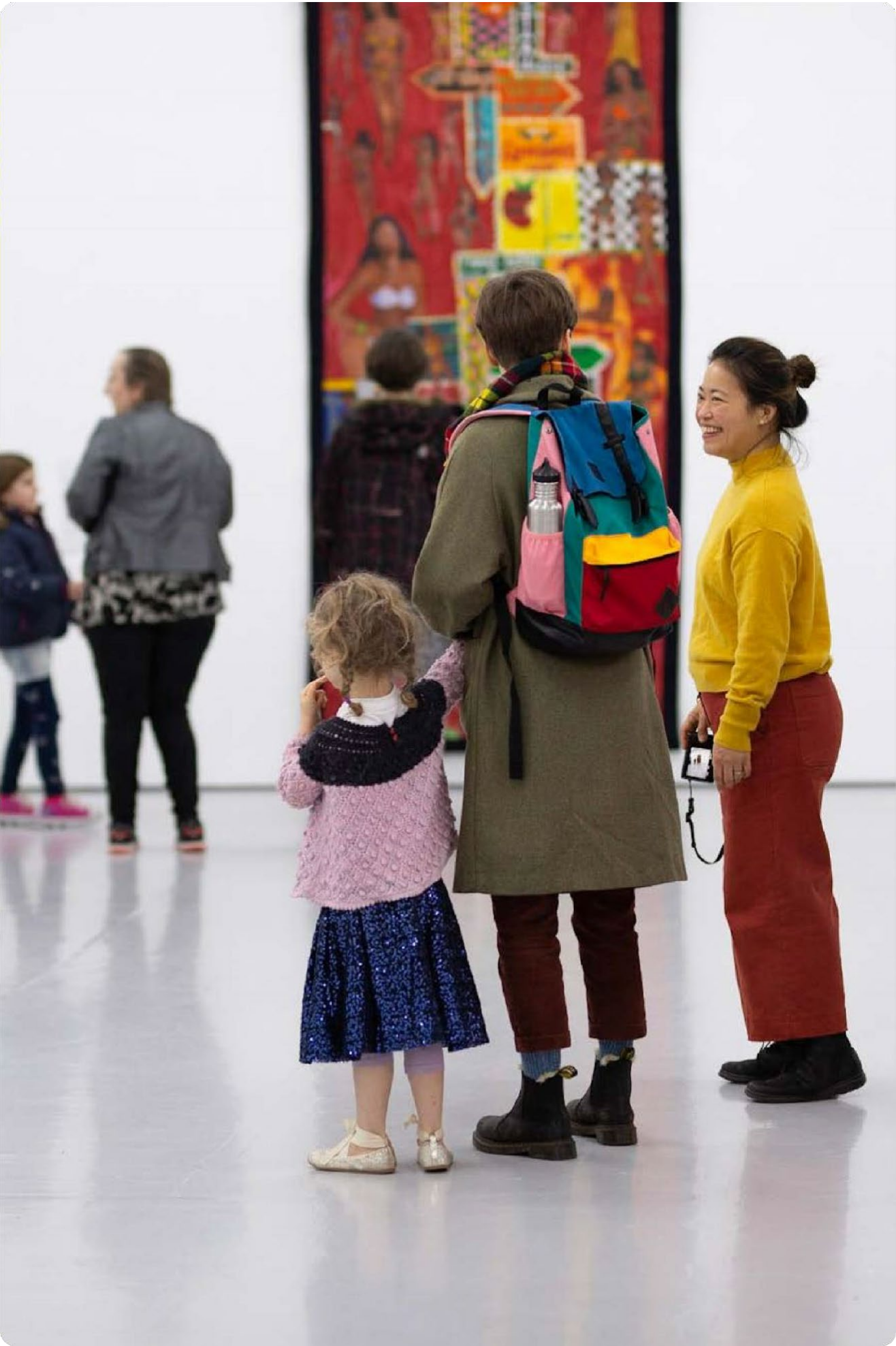
Spikelsland, Pacita Abad, Life in the Margins (2020) Works courtesy The Pacita Abad Art Estate.