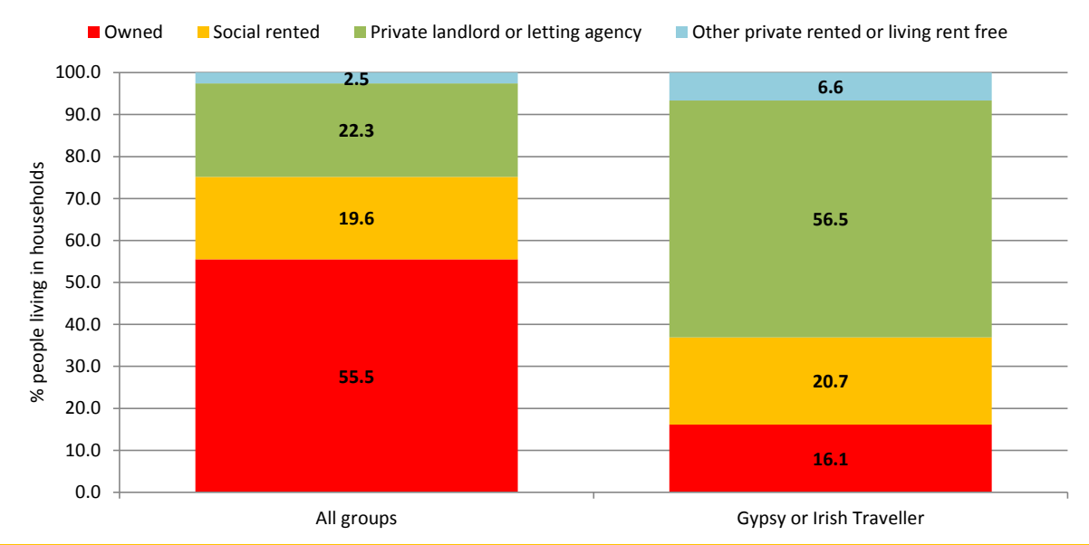
Figure 5: Tenure

Most Gypsy or Irish travellers (56.5%) rent privately from a private landlord or letting agency, a much higher proportion than in the population as a whole (22.3%). Just 16.1% own their own home which is much lower than the city average of 55.5%.