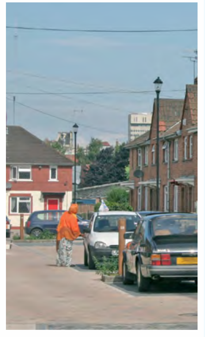
Permeable paving in The Dings

Surface water is disposed of by a combination of infiltration, evaporation and gradual release into watercourses or drainage systems. Typical SuDS components include both landscaped features such as green roofs, filter strips, swales, infiltration basins, detention basins, wet ponds and constructed wetlands as well as engineering features such as filter drains, infiltration devices, pervious surfaces (e.g. permeable pavement) and soakaways.