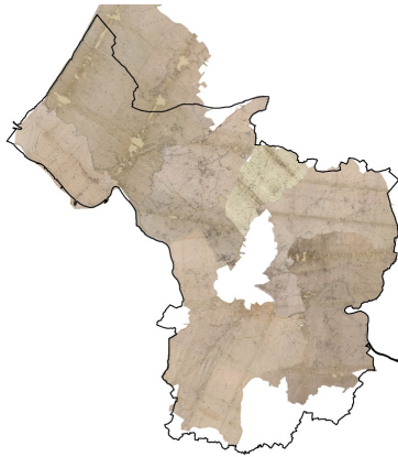
Coverage of the Tithe Maps layer.

Parish Tithe maps dating to the mid nineteenth century covering the whole of Bristol with the exception of the central area which wasn't subject to tithes, Whitchurch and Bower Ashton (these Tithe maps are held at Taunton Record Office).