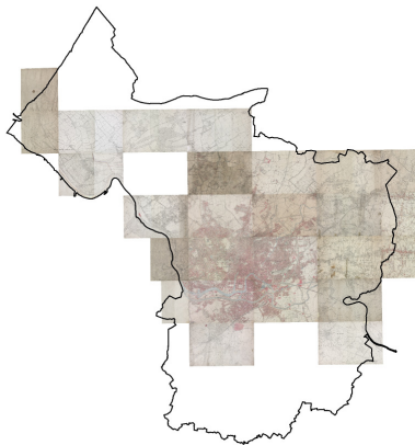
Coverage of 1 st edition OS plans

Ordnance Survey 1 st and 2 nd edition maps (Epoch 1) originally surveyed at a scale of 1:2500 in 1881-3 and 1902-3.