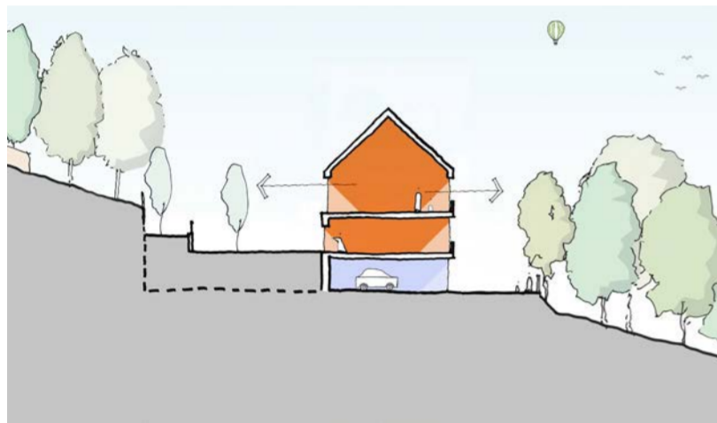
Sketch of Previous Proposal - Section