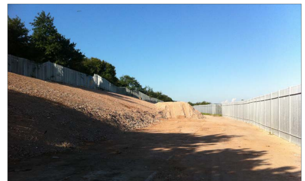
Photo of made up ground