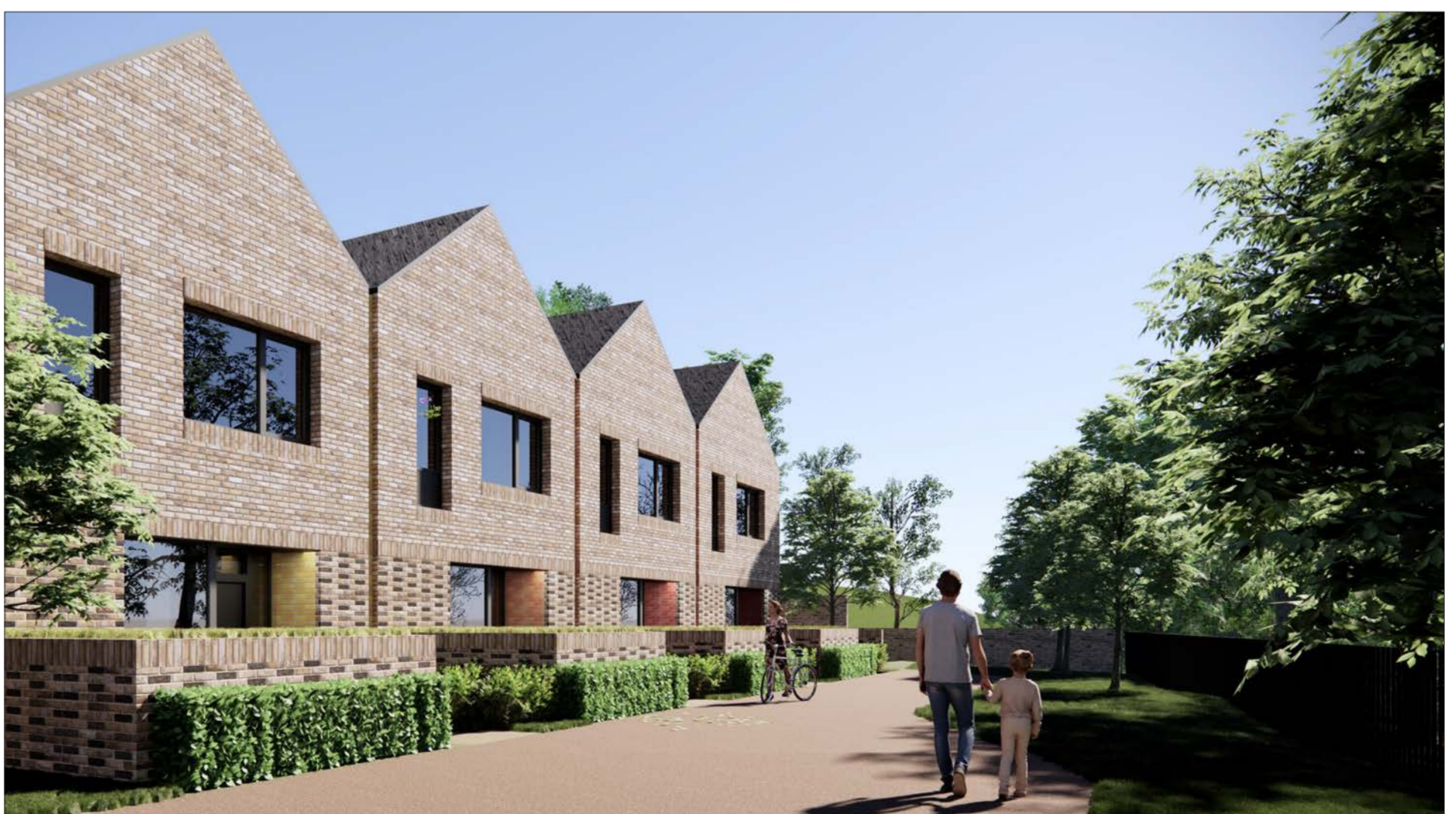
Visualisation of Proposal - Showing two bed terrace housing