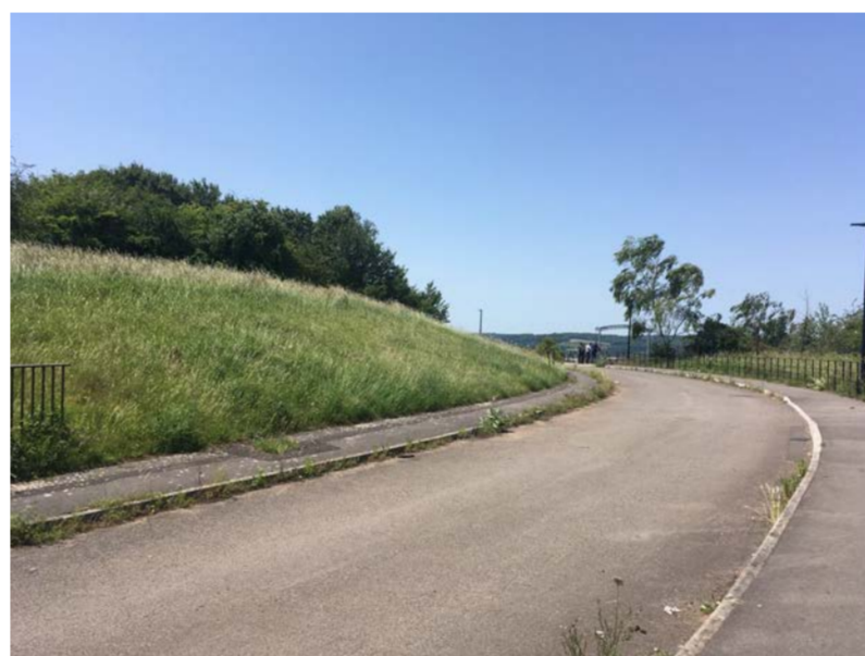
Existing road and steep slope

Due to the steep slopes, steps are unfortunately the only design solution but we however hope to minimise the gradient of these routes, improving access for all users.