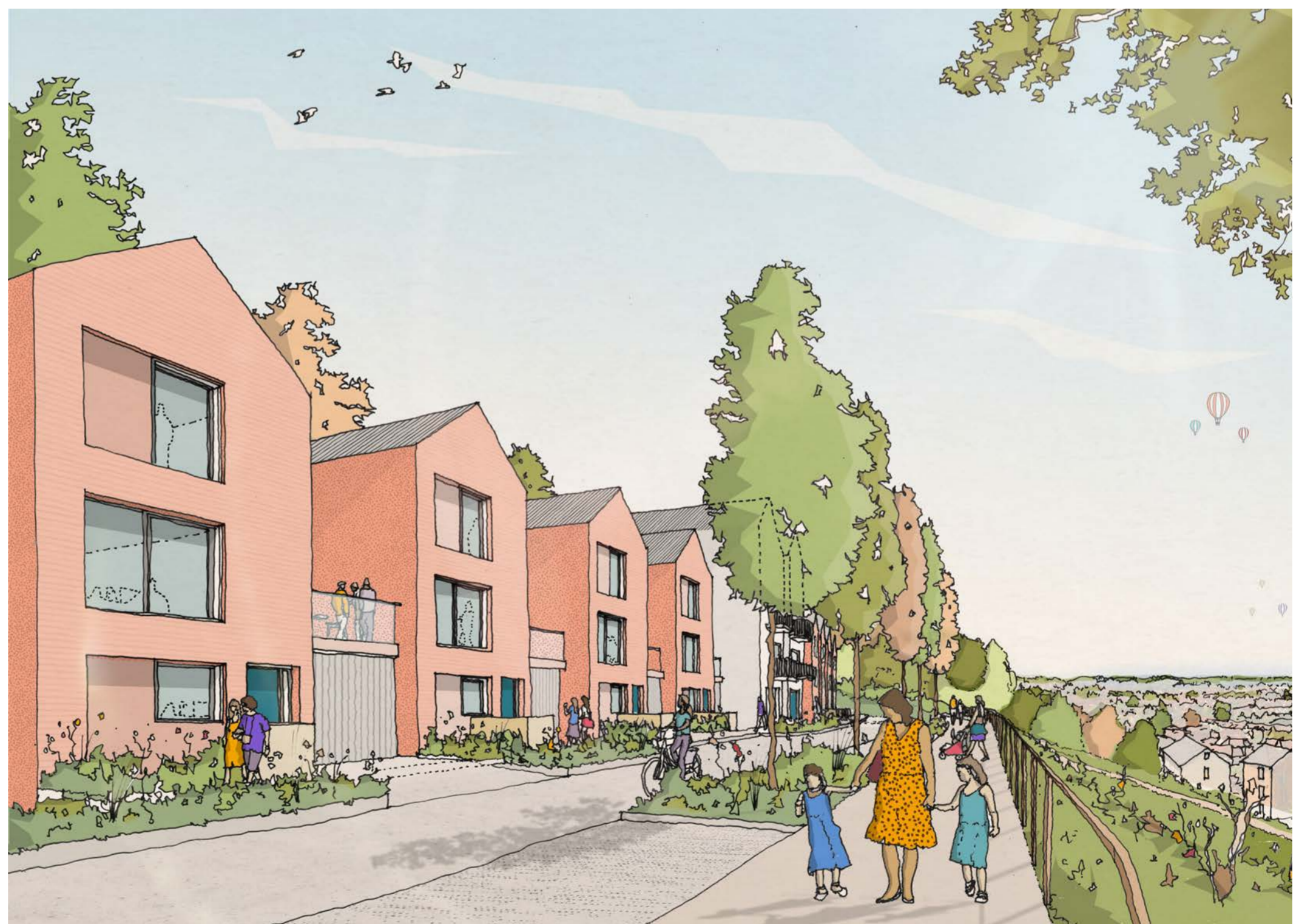
Sketch of Previous Proposal - Street View