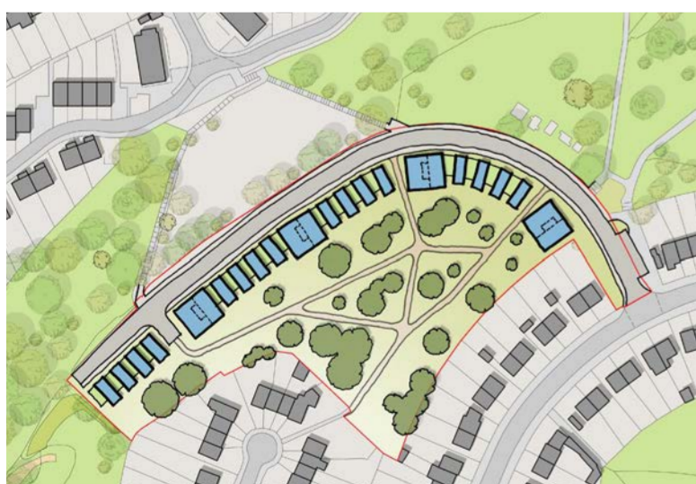
Sketch of Previous Proposal - Floor Plan