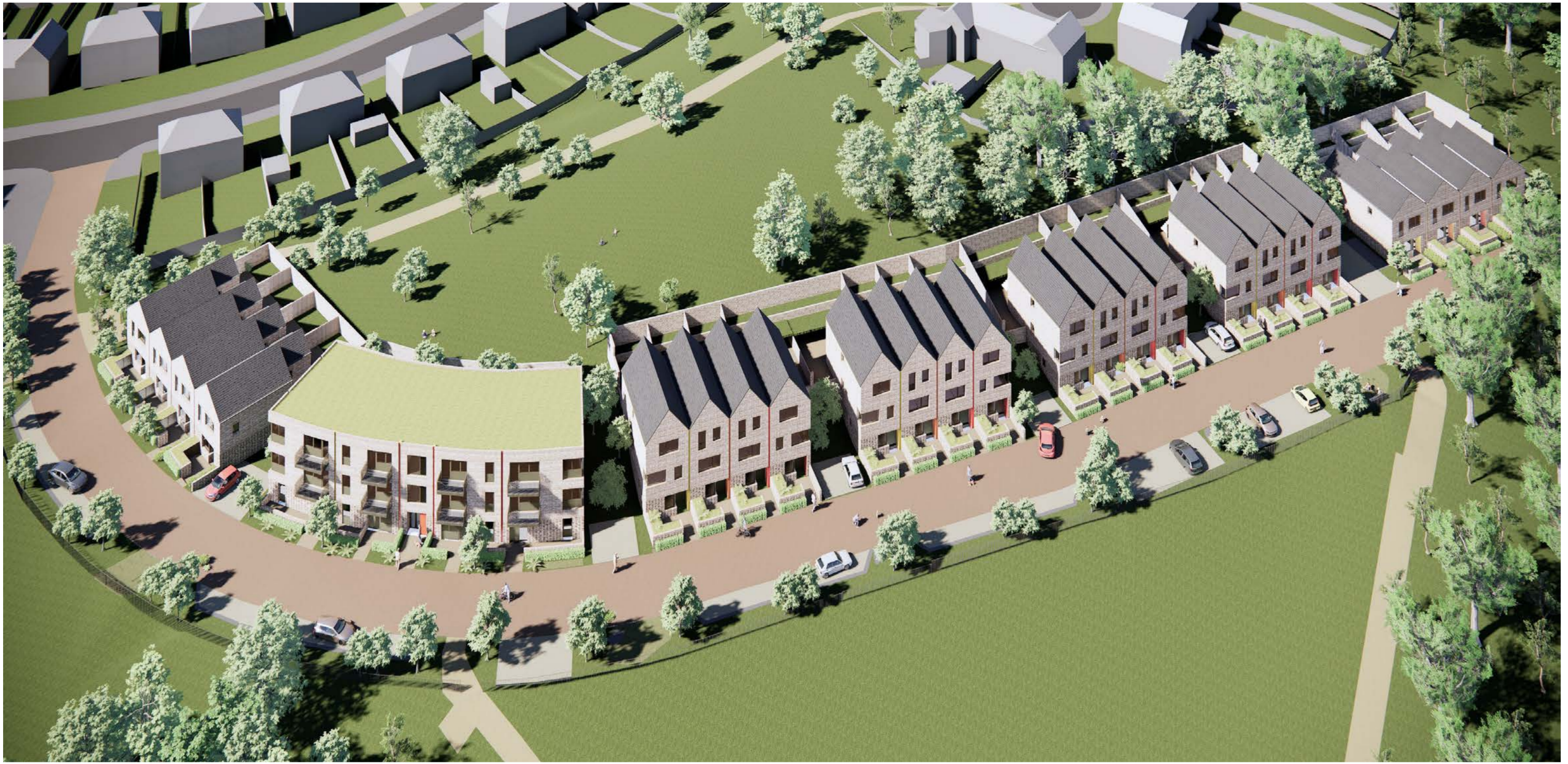
Visualisation of the Proposal - Aerial View