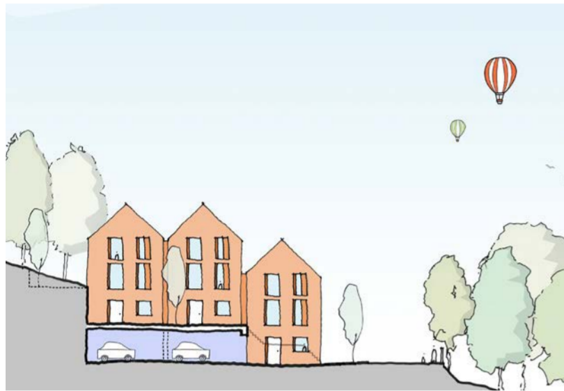
Concept Development Sketch

A summary of comments and our responses can be found on boards 5 & 6.