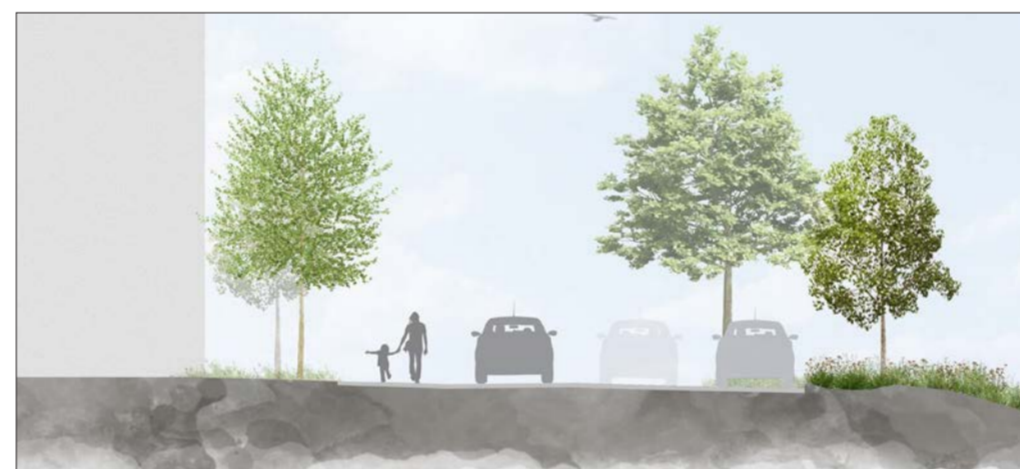
Street Section 1