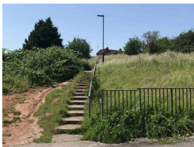
Existing footpaths cross the site