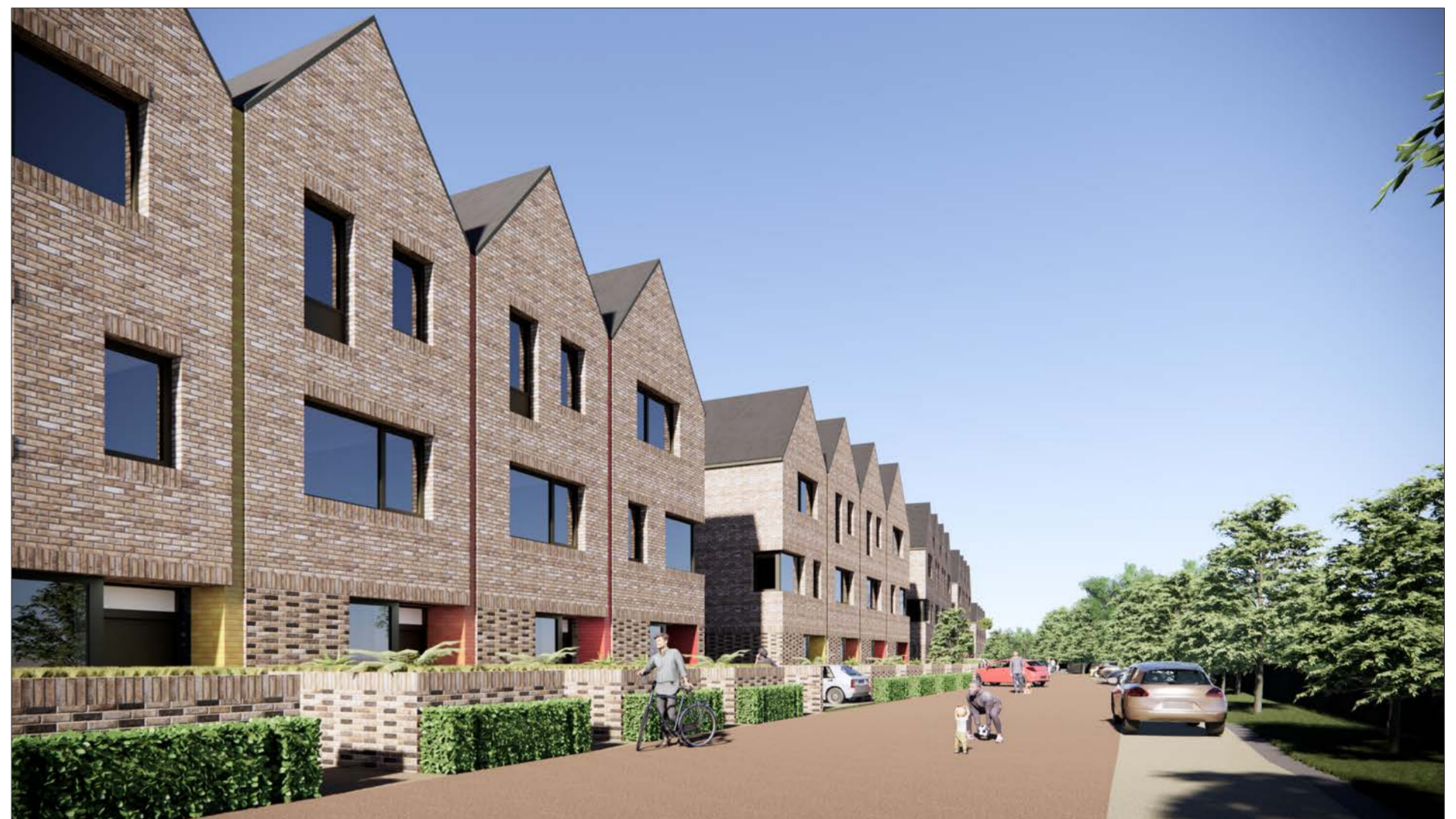
Visualisation of Proposal - Showing three storey three bed terrace housing