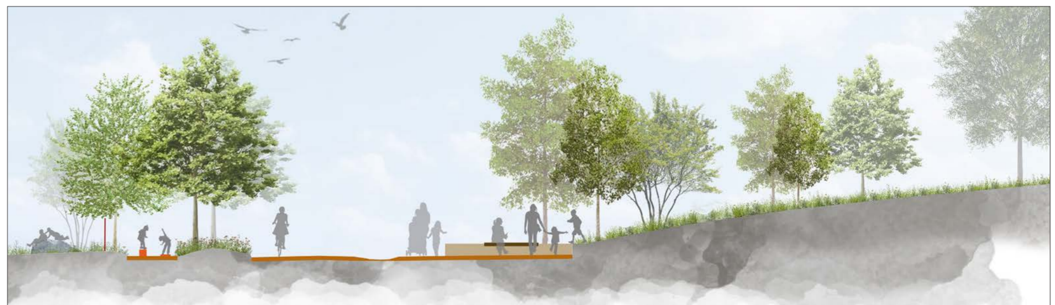
Street Section 3