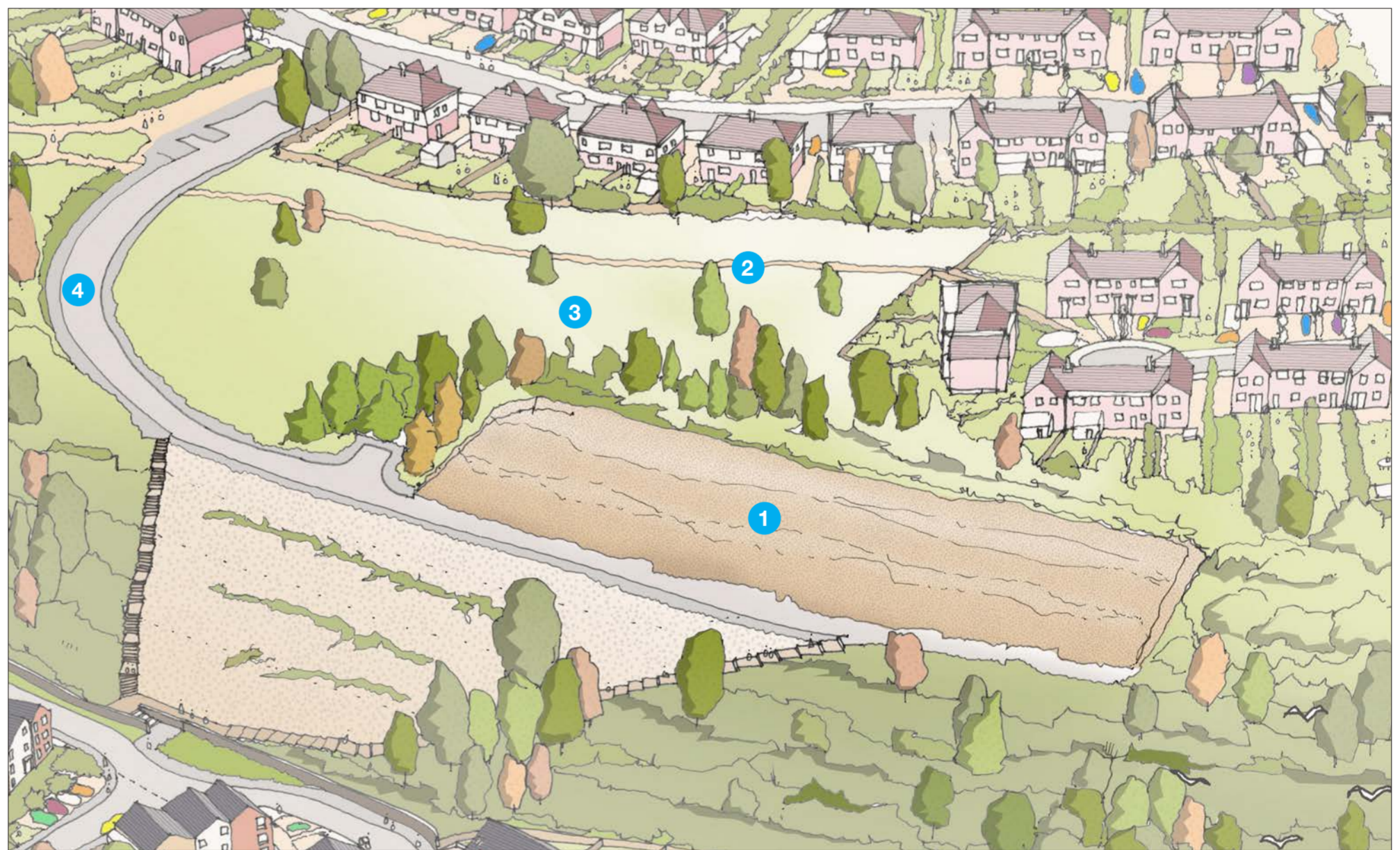
Sketch of Existing Site