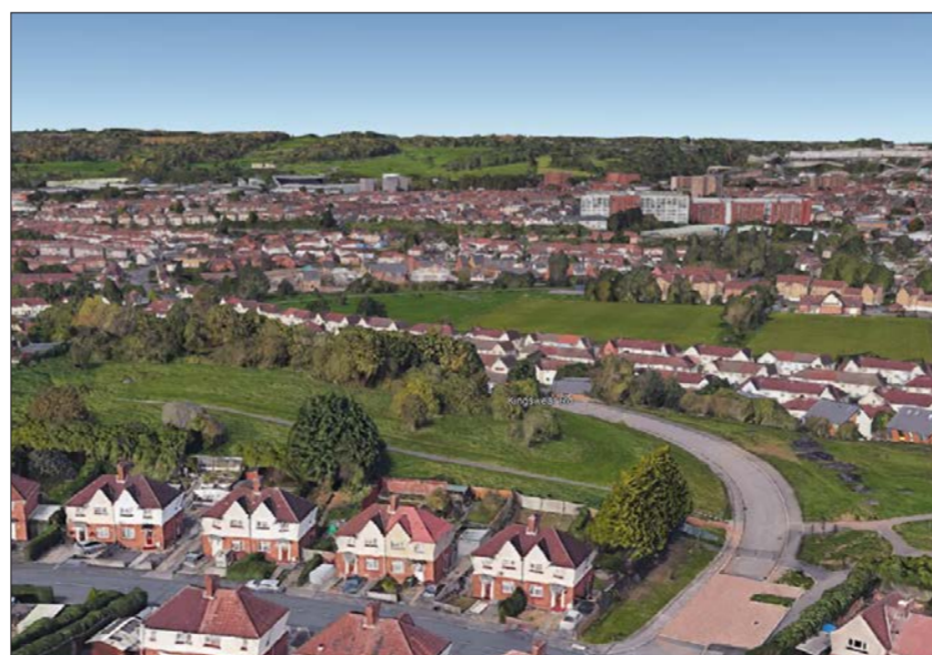
Aerial view looking north east from the site

Large areas of green open space adjoin the site to the east and west with residential properties to the south. The site was previously occupied by flats that were demolished in 2011. The remaining site area is characterised by grassland and overgrown shrubs. The Bristol Local Plan has allocated the site for Housing.