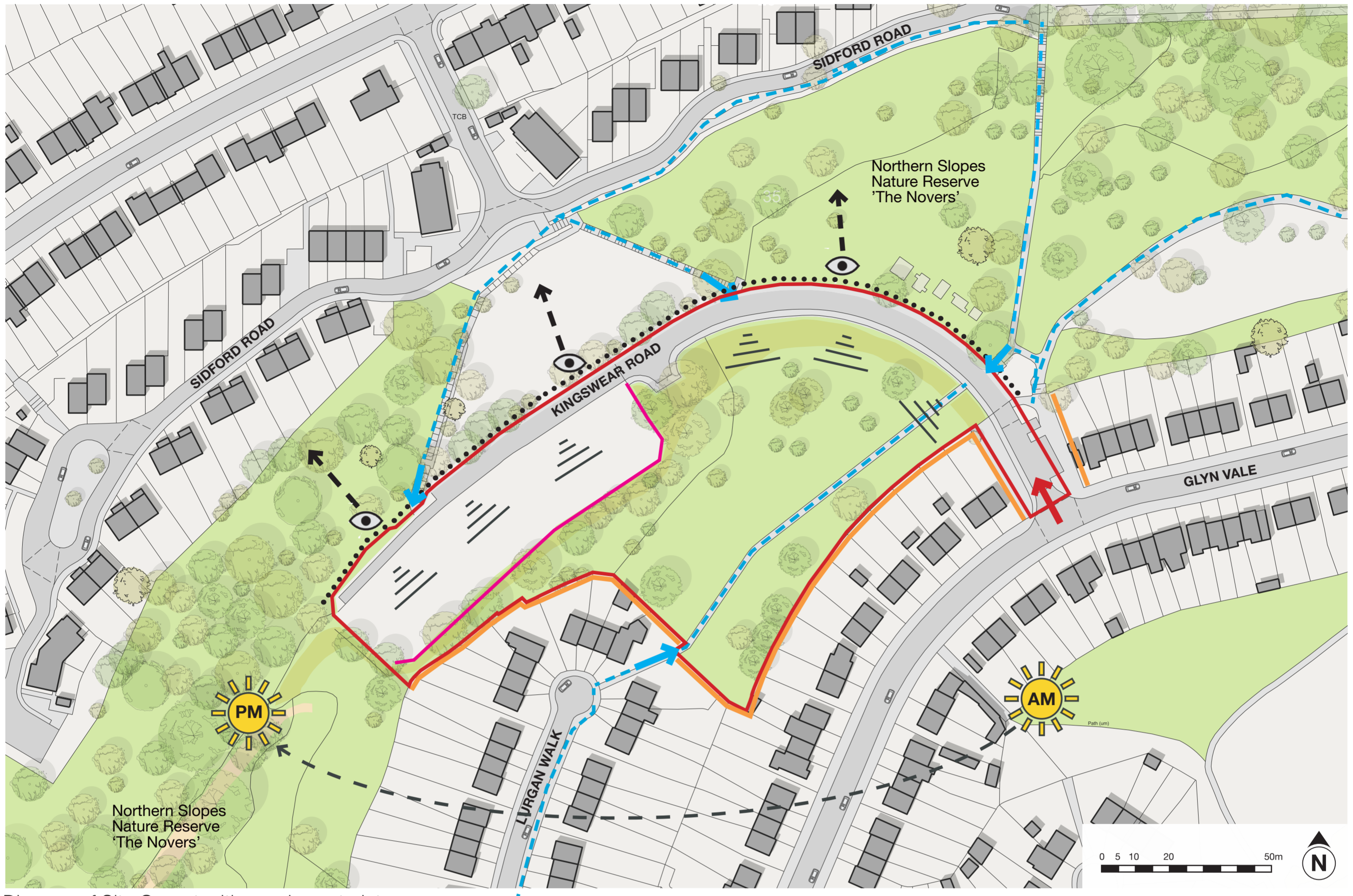
Diagram of Site Opportunities and constraints