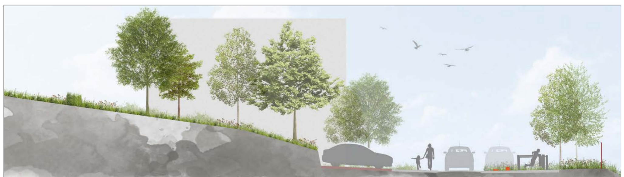
Street Section 2