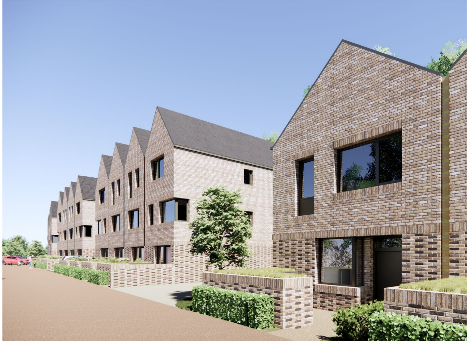
Visualisation of the Proposal - Showing terrace housing