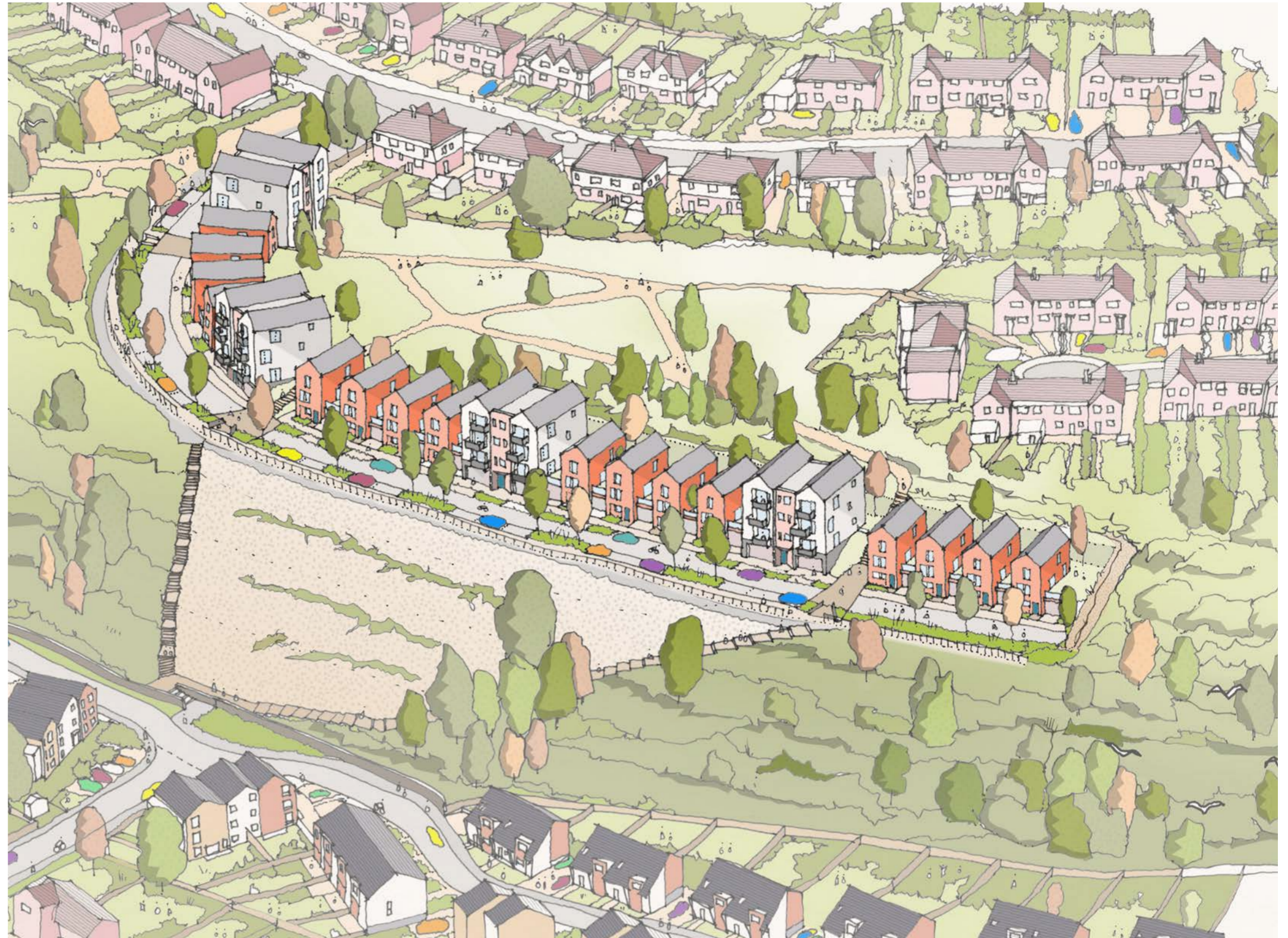
Sketch of Previous Proposal - Aerial View