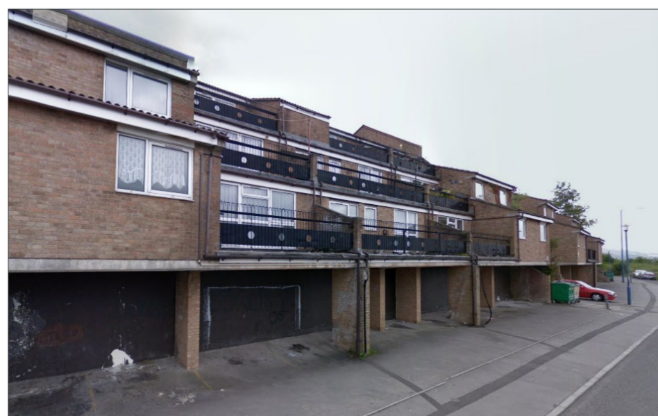
Photo of demolished building on site