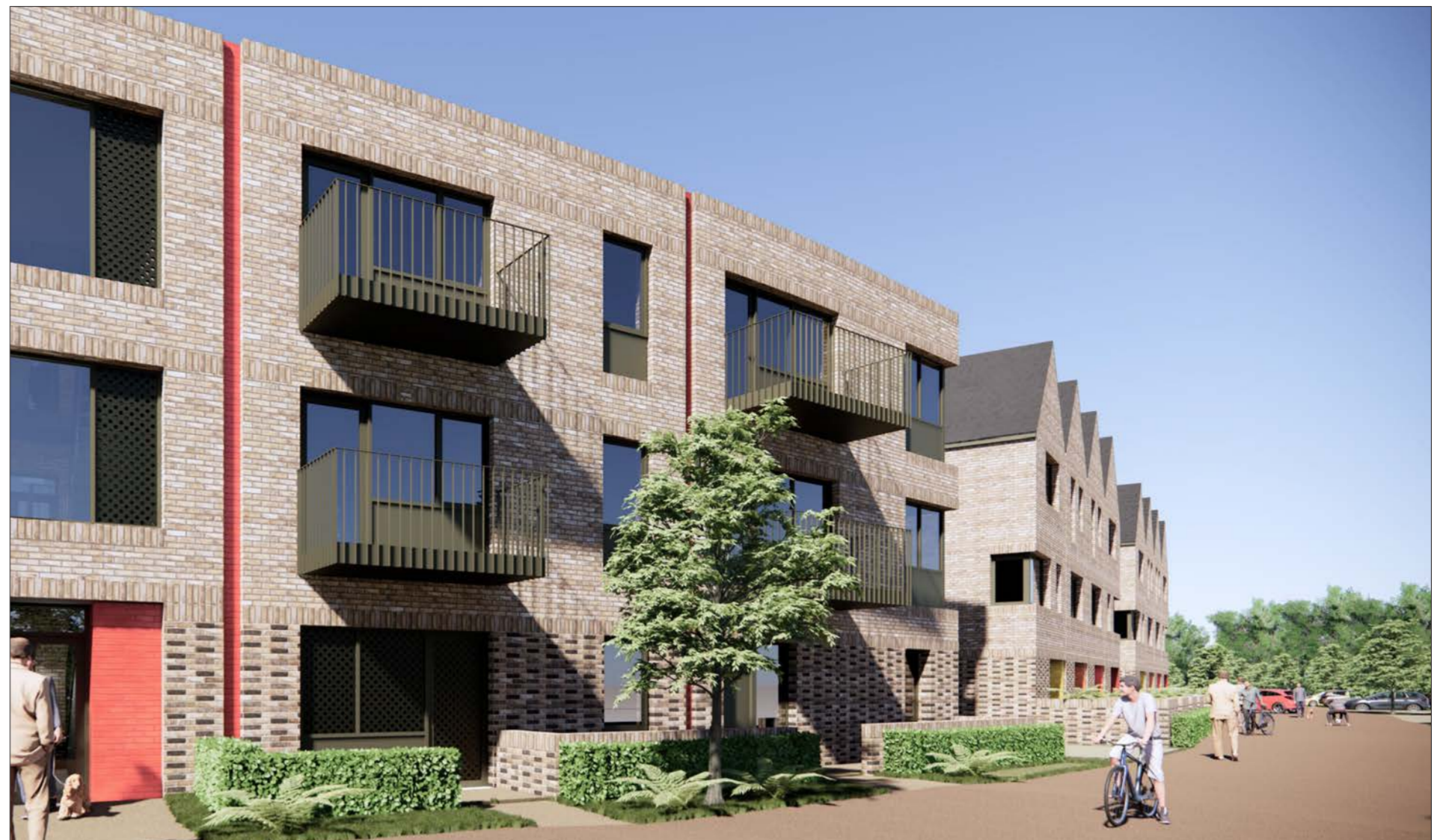
Visualisation of Proposal - Showing Apartment building

The tenure type being proposed is based upon an assessment made by the Council's Homes and Landlord Services, and is based on specific needs and requirements within the local area.