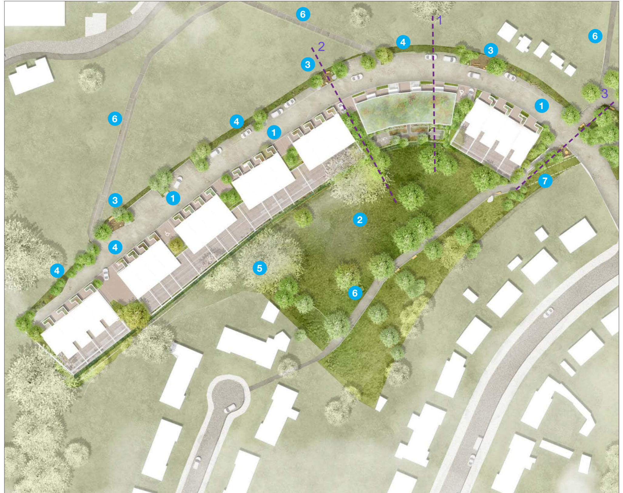
Landscape Site Plan

Ecology links are made between buildings with tree groves linking the open space of Kingswear Field to the street and beyond.