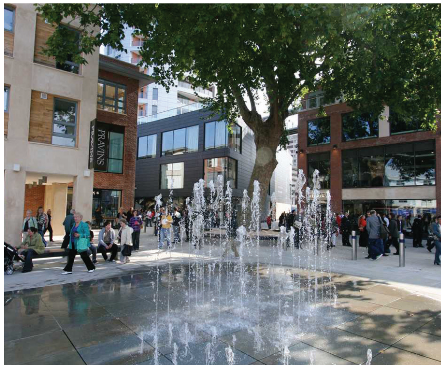
Public realm development at Quakers Friars, Broadmead

Producing a framework to guide future development and change. Working alongside local residents, businesses and the police.