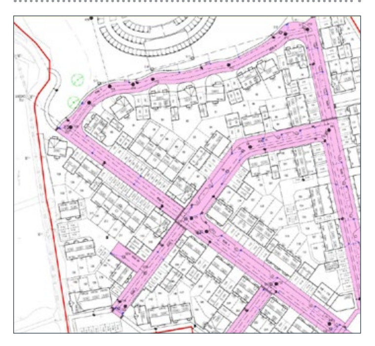
Fig 2: Example Section 38 adoption layout, Fishponds

We will enter into a process of adopting new infrastructure where the submitted design conforms to our standards of adoption and where we consider it in the public interest to insist that it should be maintainable at the public expense.