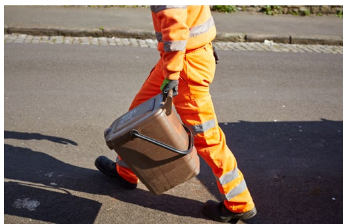
Table 1 Types of waste and recycling container

Table 1 details the size and volume of the waste and recycling containers issued to houses and buildings with up to six flats.