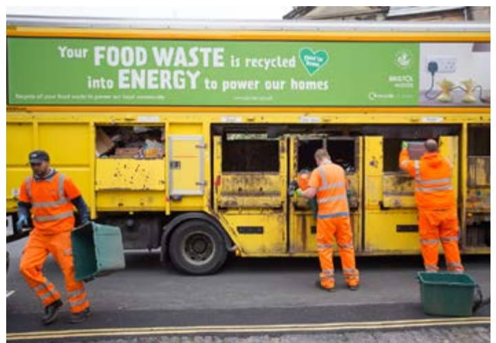
Fig 2: Recycling collection

Guidance on the provision for the number and size of waste containers and size of storage areas can be found in the Waste Guidance .