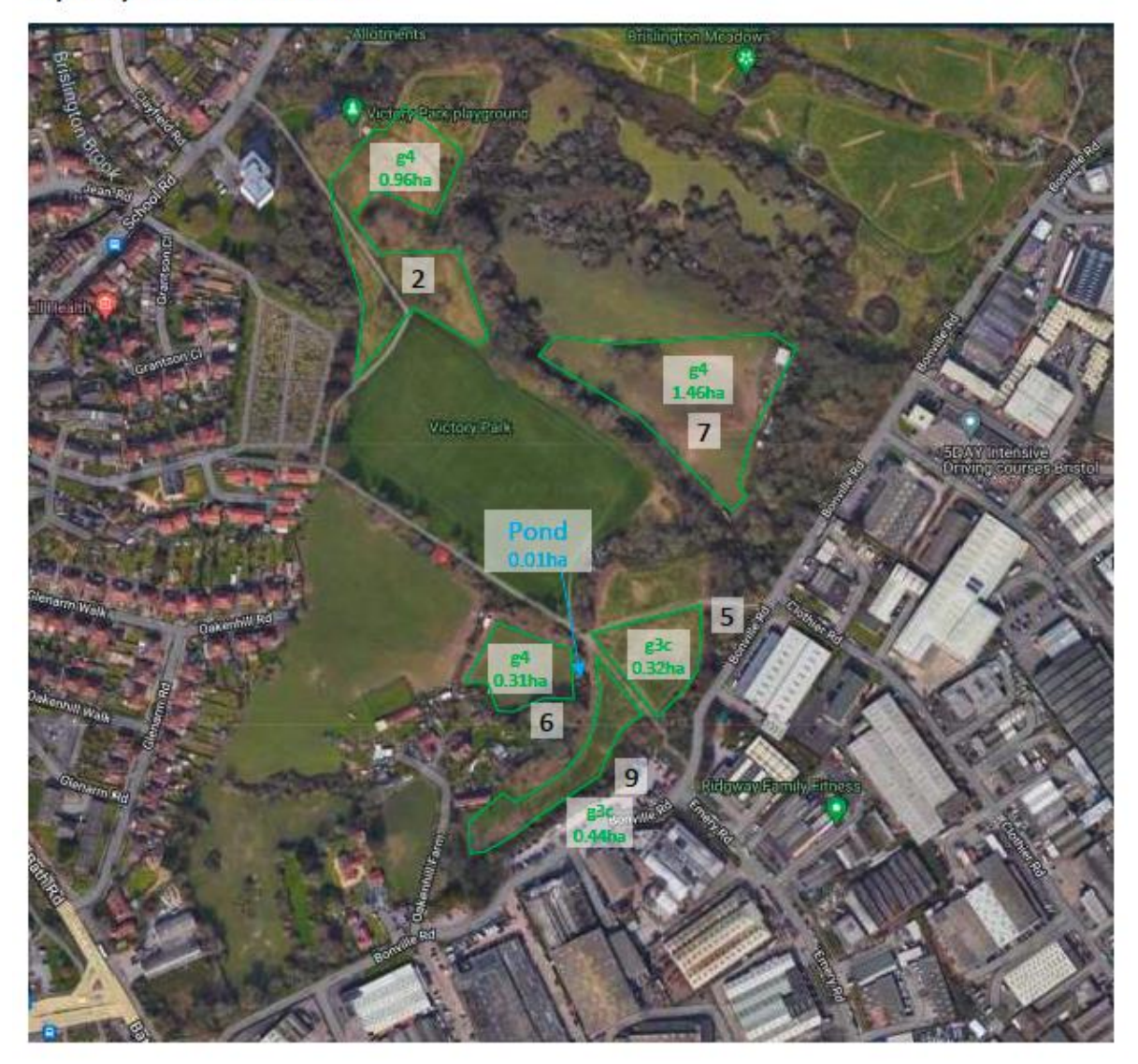
Figure 1: Extract from CD16.8. Annex D p.2 (pdf p.95)