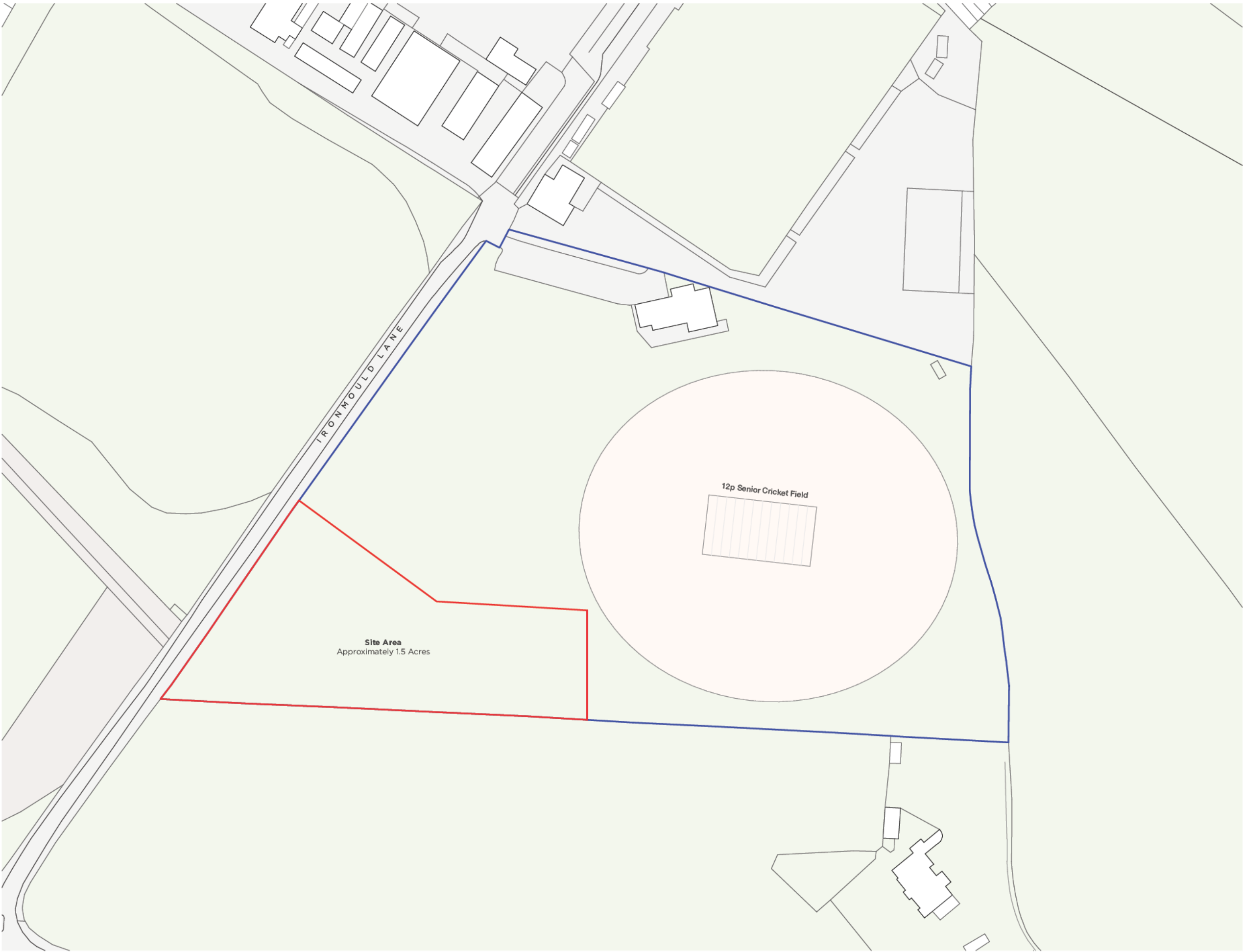
1400-F-001.B Site Plan 1:1250@A3