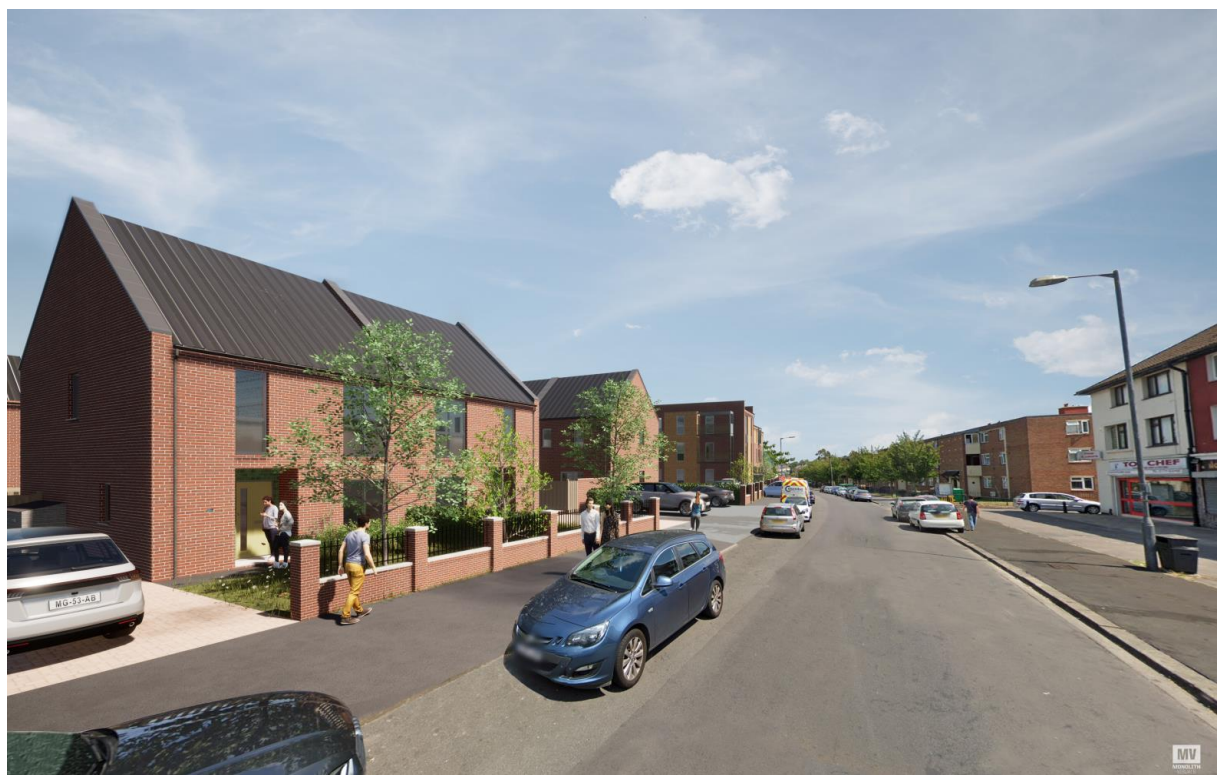
View along Bishopthorpe Road, new houses on the left

Bristol City Council would like to invite expressions of interest from suitably experienced and constituted organisations or partnerships that may wish to take a Lease of the new community facilities that are currently under construction on the St Peter's site in Bishopthorpe Road. This document sets out what is on offer and what we require from the successful bidder.