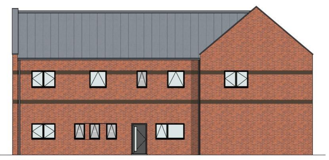
Rear Elevation C (North)

Proposals from commercial organisations, or projects that do not have a local connection, or that don't deliver social, economic, and environmental benefits for the local community are unlikely to be considered.