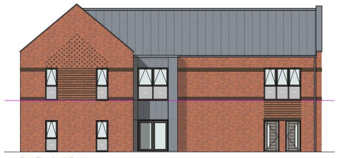
Front Elevation A (South)