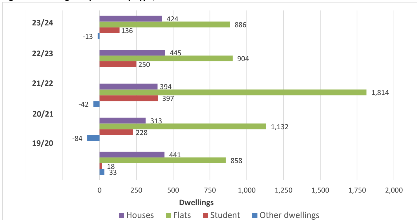
Figure 3: Housing Completions by Type, 2020-2024

Between 1 April 2019 and 31 March 2024, 86% of completions 2 were on brownfield land. In 2023/24, 1,433 net dwellings were completed. This was comprised of 424 houses, 886 flats, and 136 purpose-built student 3 units (see Figure 3).