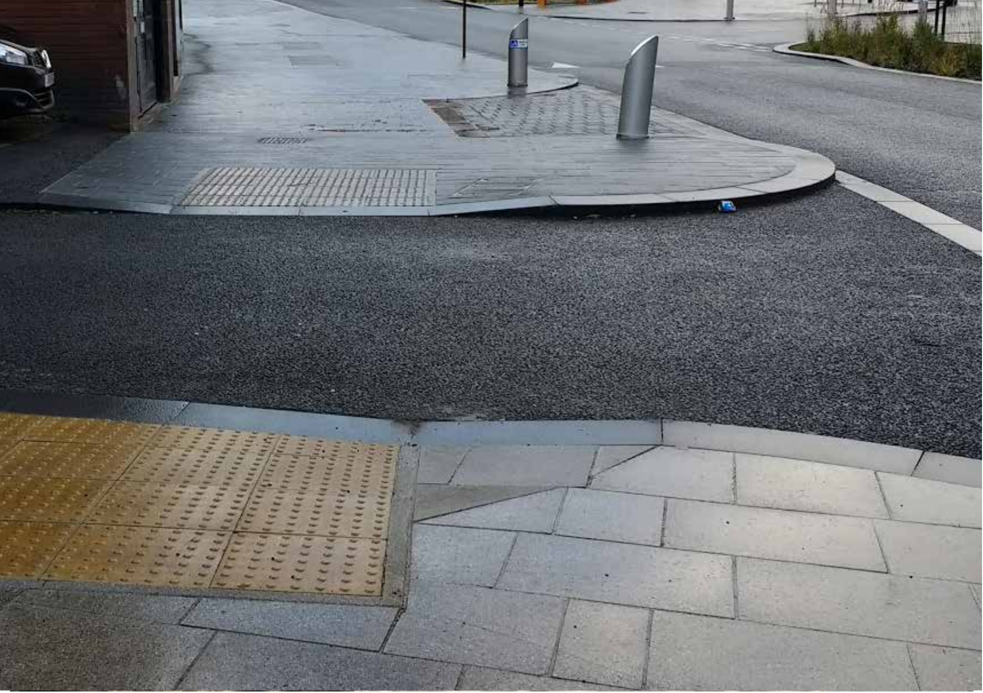
Buildouts both sides of the side roads on to Two Mile Hill will create narrower crossing points making it easier and safer to cross