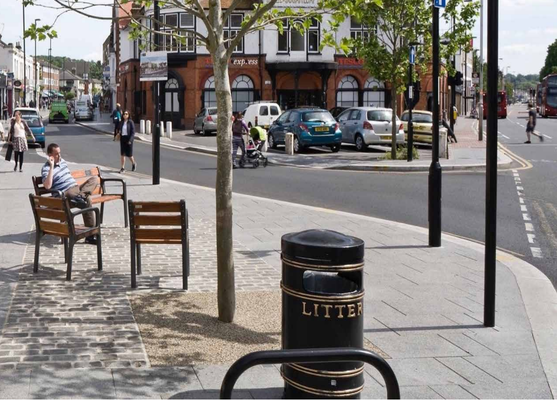
Big new build outs and seats on Waters Rd and Grantham Rd with new paving and seats will create new places to stop and sit

All the pictures are examples from other places, just to give a bit of an idea of how things might look