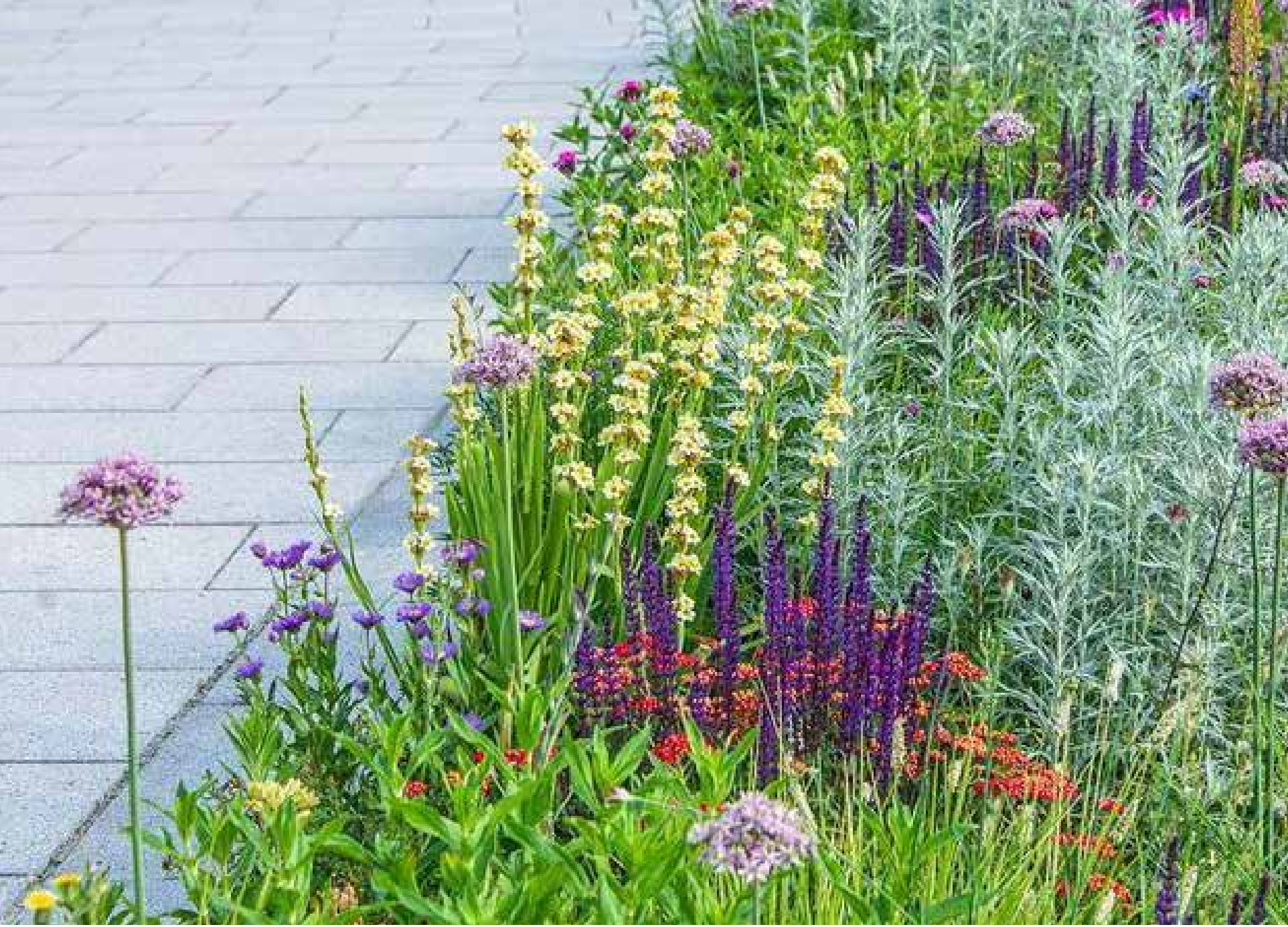
New planting around the mature tree on the corner of Waters Rd will give more space for the roots and bring colour & interest