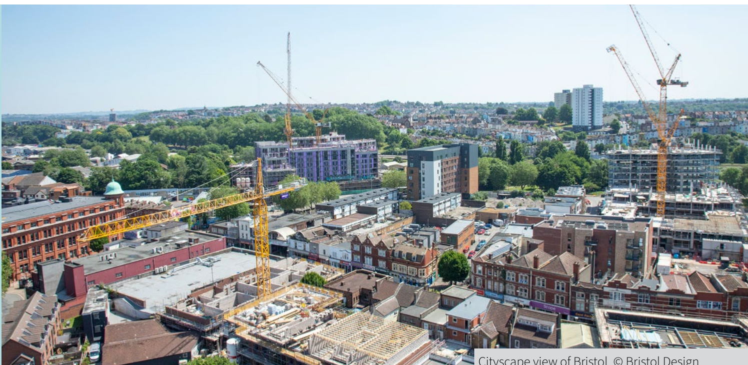
Cityscape view of Bristol