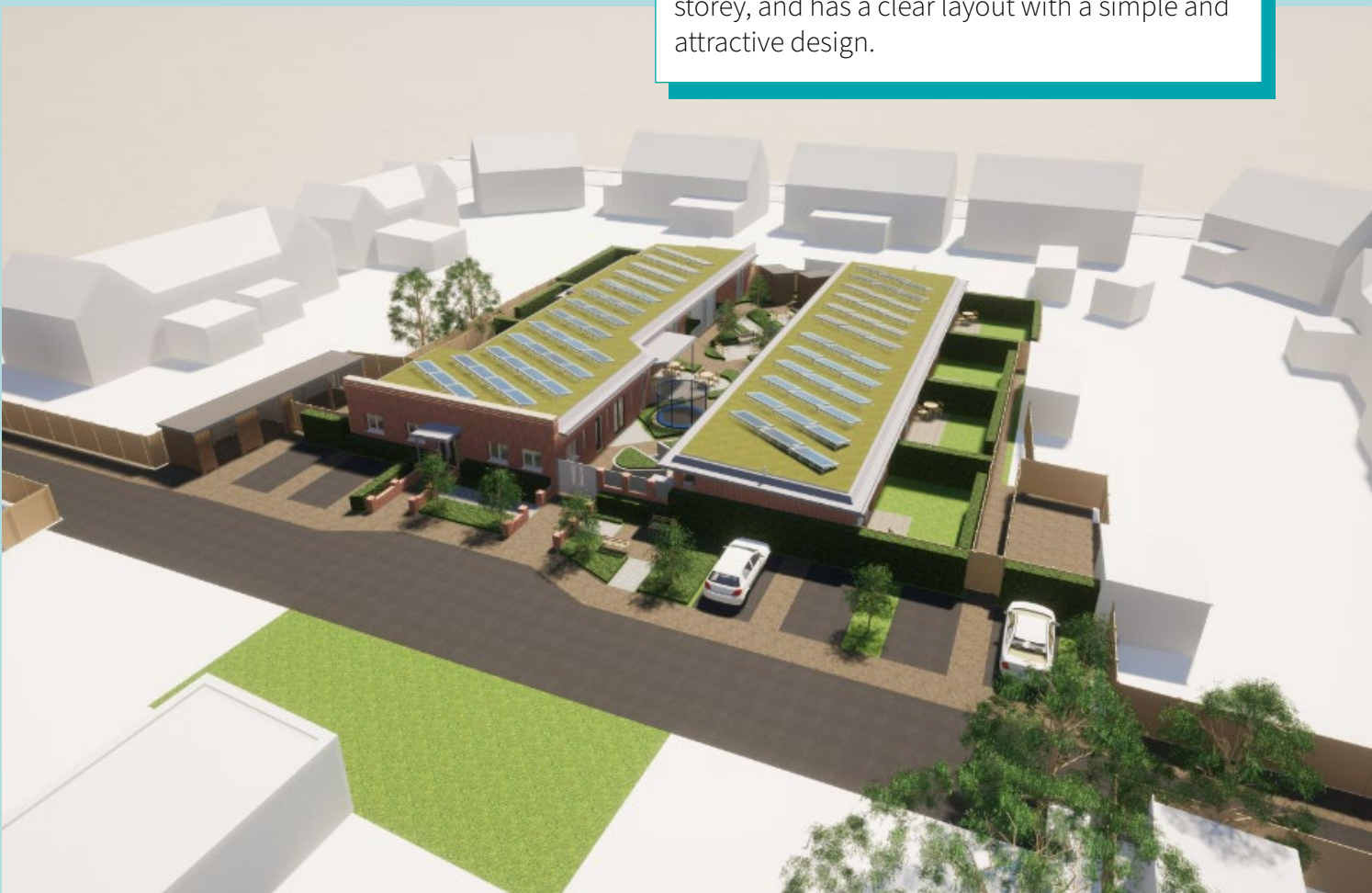
The Haven Designs – Overhead (source: NOMA architects, 2023)

There has been a collaborative approach to scheme design to suit the specialist needs of the residents. The scheme includes accessible units including two homes for wheelchair users, private outdoor space, sustainable design, single storey, and has a clear layout with a simple and attractive design.