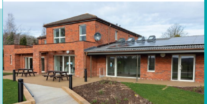
Addison apartments

All the homes in the scheme have been designed to meet the needs of people living with physical disabilities with two of the homes meeting M4(2) building regulation requirement and three meeting M4(3). The homes were also built with sustainability in mind, with solar panels installed and a green roof. A collaborative approach was taken to design and deliver the scheme, and partners included KKE, Kier, AECOM, and Milestones.